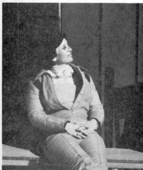
Do Not Disturb!