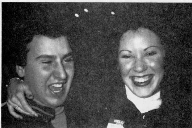
Jet Set Winners!