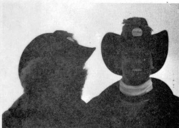
Carnival King + Queen