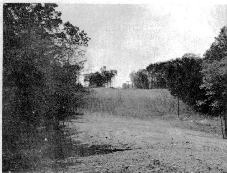
AT THE BASE OF THE 250 FT. WIDE UPPER SLOPE. ALL OF THE SLOPES WILL BE GRADED AND SEEDDED.