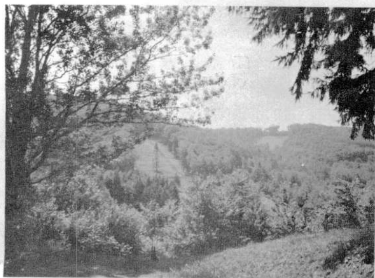
LOOKING ACROSS FROM THE CEMETARY AREA. THE 250 FT. WIDE HEADWALL SLOPE UPPER RIGHT AND THE 100 FT. WIDE SLOPE LOWER LEFT.