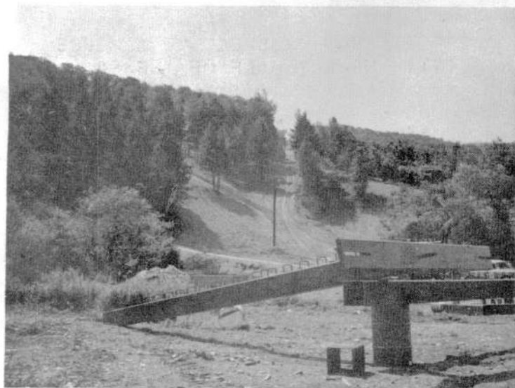
LOOKING UP THE NEW LIFT LINE FROM THE BASE AREA ALONG ROUTE 242. MOST OF THE TOWERS ARE NOW IN PLACE.